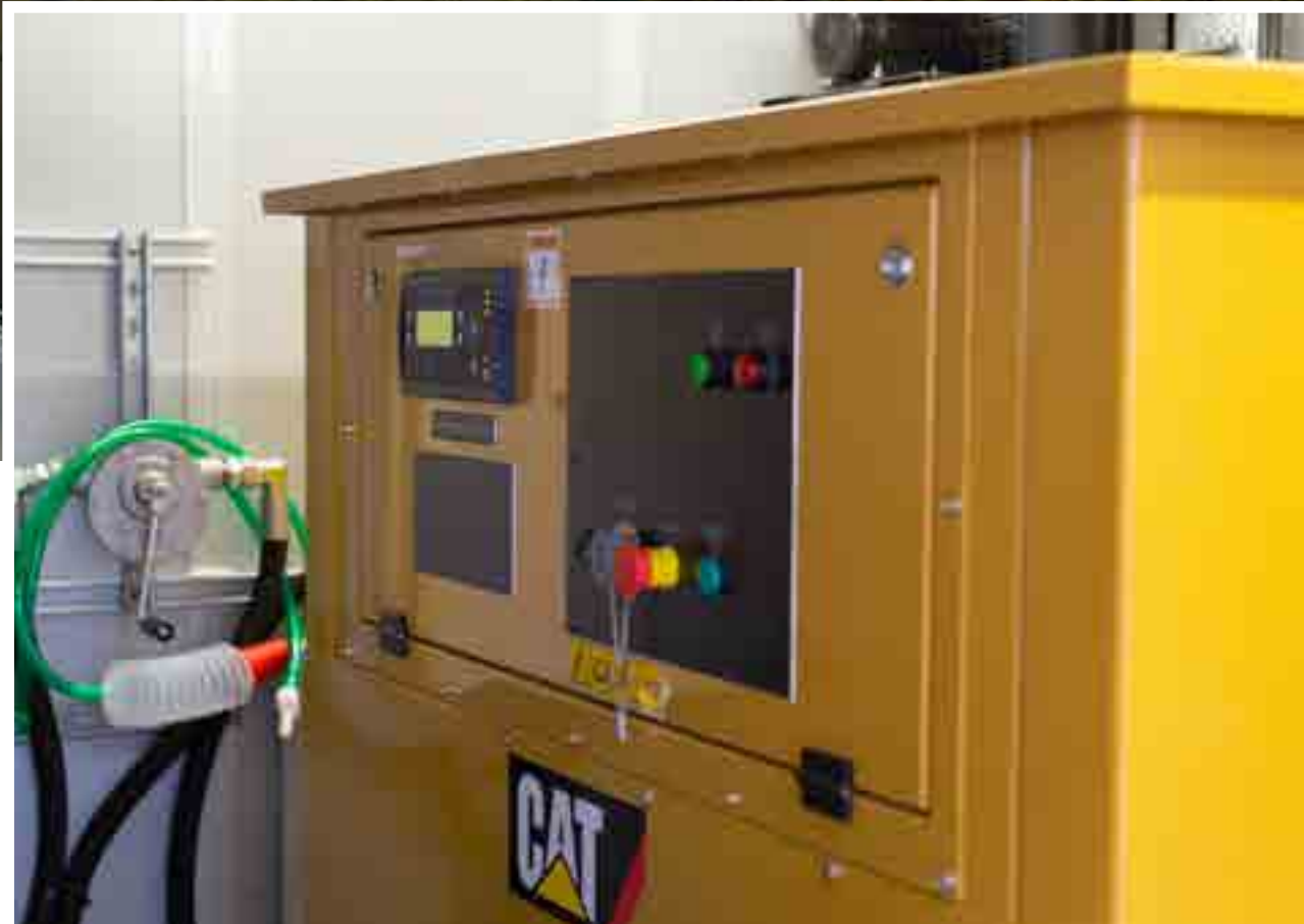
One of the data centre's two 2.5 MW emergency generators with a DEIF AGC-4 controller

I'm quite satisfied with DEIF. It has what you need, and it's a stable and robust system that is very easy to configure and set up.